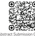
Abstract Submission Guidelines